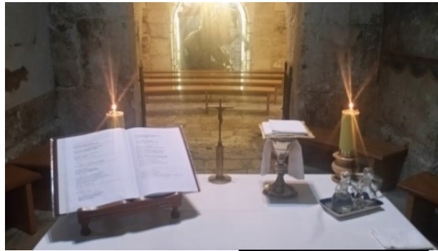
Church of the Nativity Bethlehem, Israel 2017

Jesus wants us to make choices that reflect His presence in our hearts. Life constantly presents us with opportunities to choose to love & serve one another. It is not about us, it is about reaching out in love. Go to the Author of Life. Go to the Sacraments of Confession & Communion often.