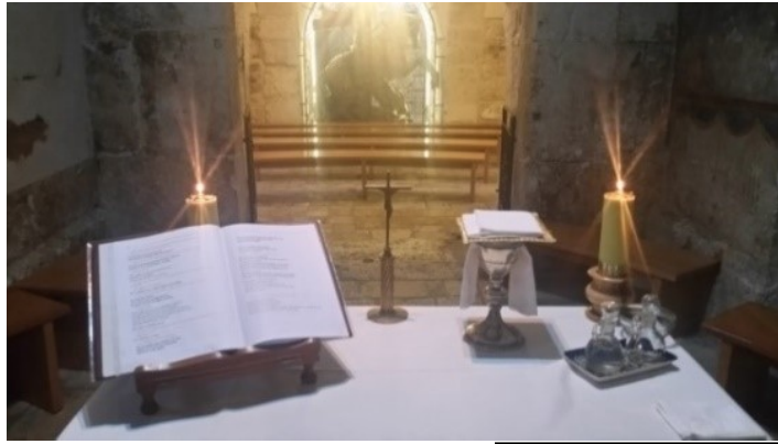
Church of the Nativity Bethlehem, Israel 2017

Foregiveness is a Gift that we give first to ourselves then to the other. Jesus wants us to make choices that reflect His presence in our hearts. Life constantly presents us with opportunities to choose to love & serve one another. It is not about us, it is about reaching out in love. Go to the Author of Life. Go to the Sacraments of Confession & Communion often.