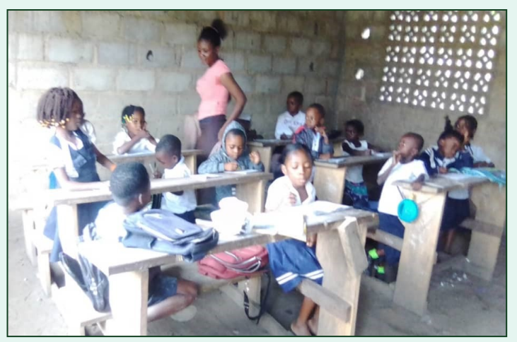
This is a picture of one of the classrooms built with your donations at St. Hilary School of the Congo.