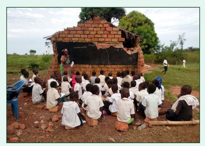
This is a picture of classroom in Tshela before St. Hilary School of the Congo was built.