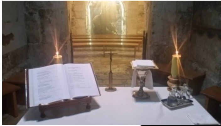
Church of the Nativity Bethlehem, Israel 2017

Foregiveness is a Gift that we give first to ourselves then to the other. Jesus wants us to make choices that reflect His presence in our hearts. Life constantly presents us with opportunities to choose to love & serve one another. It is not about us, it is about reaching out in love. Go to the Author of Life. Go to the Sacraments of Confession & Communion often.