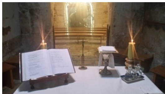
Church of the Nativity Bethlehem, Israel February, 2017

You are indeed my Lord, God and Savior. Amen. And AMEN.