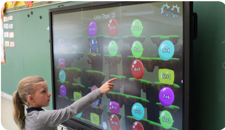
A second grader works on math skills using a Promethean Board. Interactive boards are in use in every classroom in the school.

Children growing up in today's world face a different set of challenges and opportunities than those of previous generations. The forceful pull of popular culture, coupled with the exponential growth of new, previously unheard of career fields, bring uncharted waters for parents trying to guide their children safely to adulthood. In these times, it is essential that families have a school setting that not only shares, but fosters and furthers their beliefs. In a world of uncertainty, St. Hilary School provides a solid partner for parents seeking to raise their children with a strong moral compass and an eye toward developing sound academic skills, as well as leadership, character, and wholeness of person. Grounded in the tenets of the Catholic faith, respected for nearly 60 years of excellence in Catholic education, and a leader in cutting edge technology and programs, St. Hilary School provides a setting that blends tradition and innovation to give students the best possible learning experience for their kindergarten through eighth grade years.