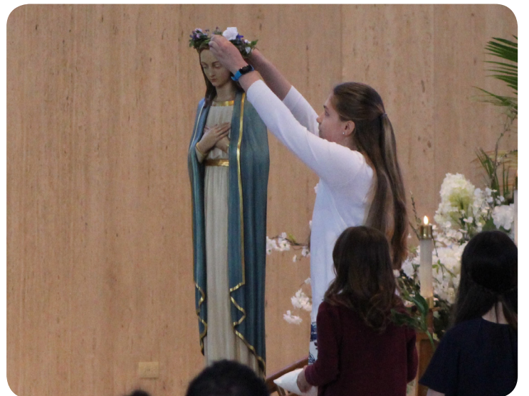
Faith is the foundation upon which the school stands. Weekly Masses and other services help foster students' faith formation.