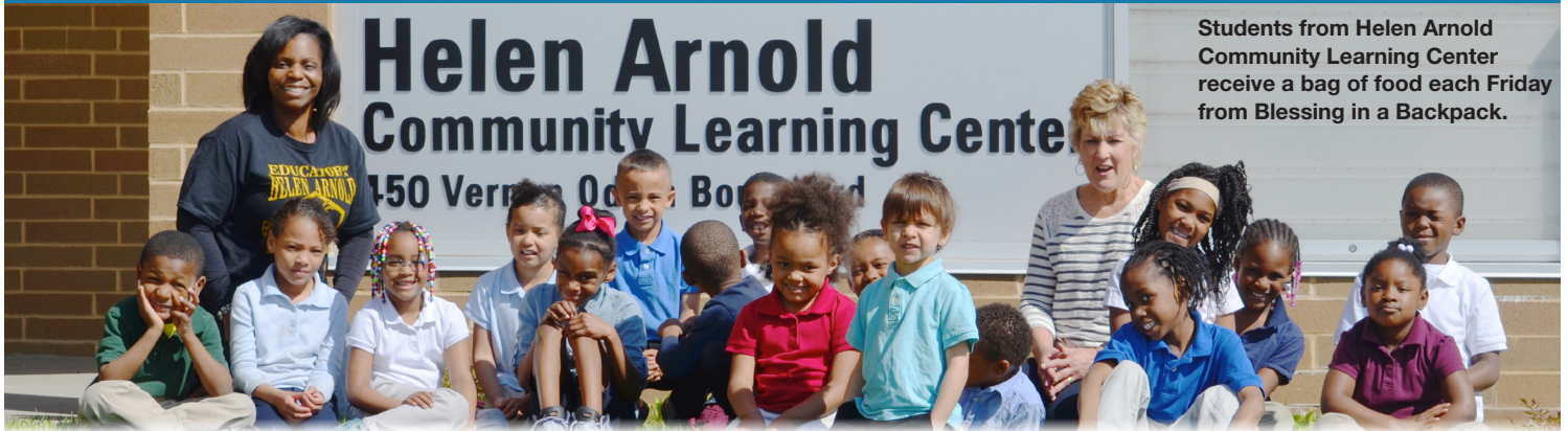
Students from Helen Arnold Community Learning Center receive a bag of food each Friday from Blessings in a Backpack.